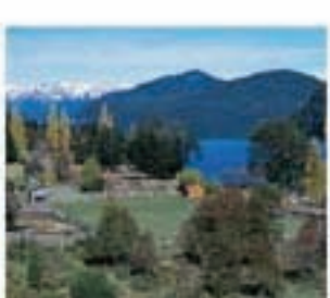
Nombre: ... Descripción: ... Ubicación: ... Fecha: ...