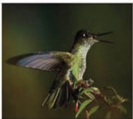
Photo: [unreadable] Photo: [unreadable] Caption: [unreadable] Caption: [unreadable]