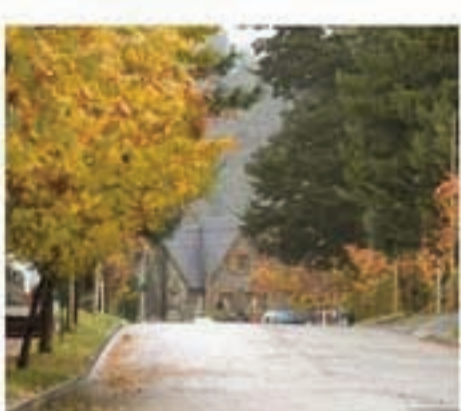
Nombre: ... Descripción: ... Ubicación: ... Fecha: ...