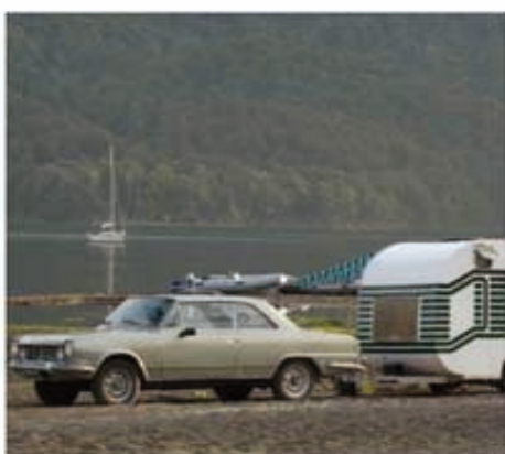
Modello: Audi Anno: 1968 Cilindri: 4 Cilindrata (cm³): 1600 Velocità massima (km/h): 140 Consumo (litri/100km): 10