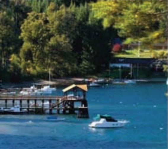
Nome: ... Indirizzo: ... Telefono: ... Sito web: ...