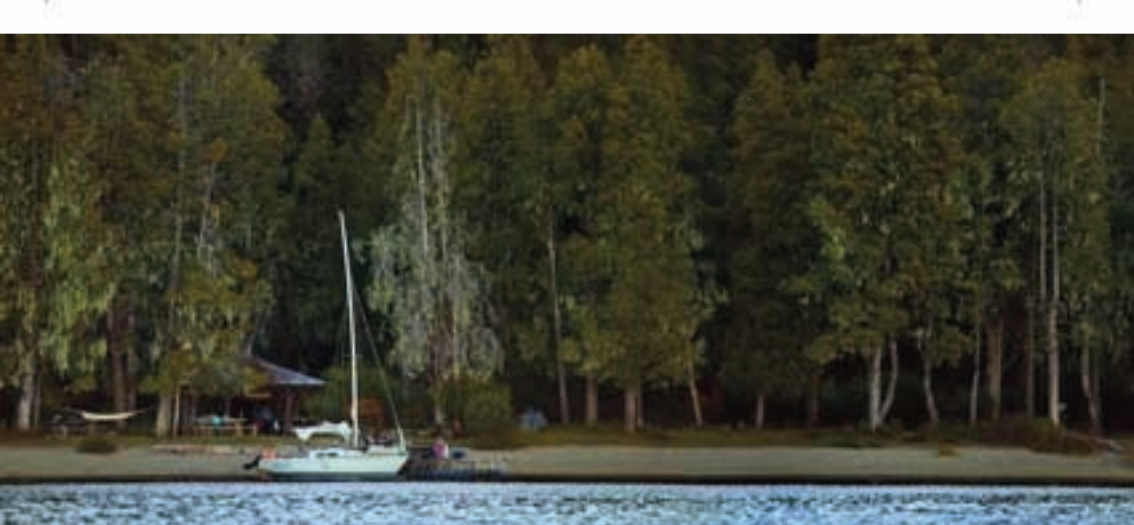
Photo: [unreadable] Photo: [unreadable] Caption: [unreadable] Caption: [unreadable]