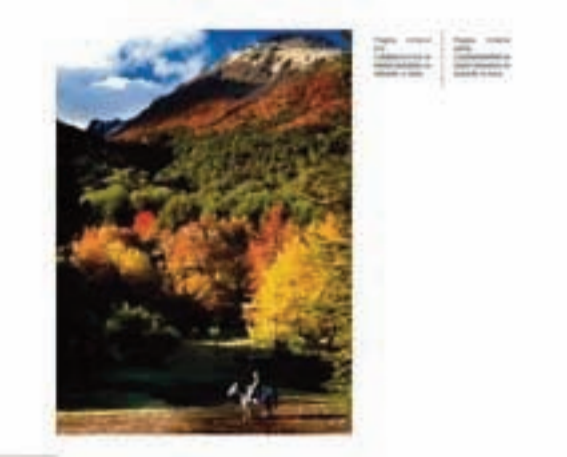
Nome: ... Indirizzo: ... Telefono: ... Sito web: ...