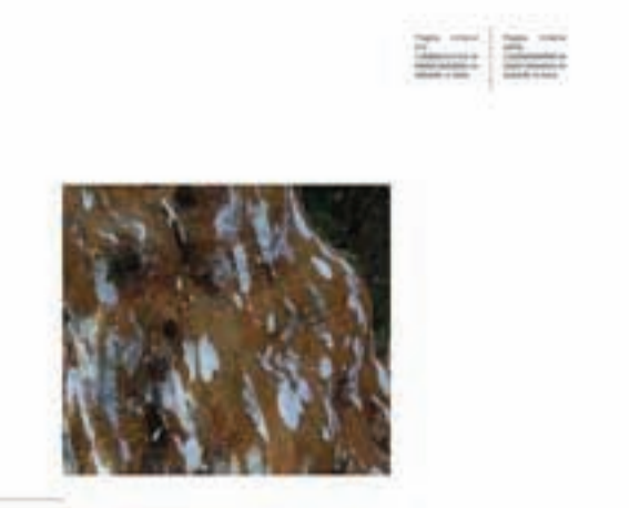
Nome: ... Indirizzo: ... Telefono: ... Sito web: ...