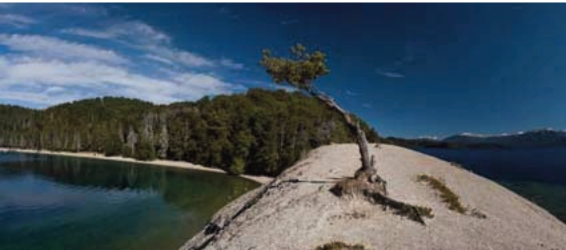
Photo: [unreadable] Photo: [unreadable] Caption: [unreadable] Caption: [unreadable]