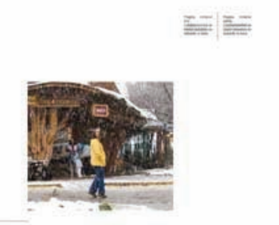
Nome: ... Indirizzo: ... Telefono: ... Sito web: ...