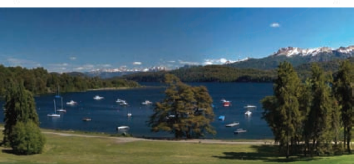
Photo: [unreadable] Photo: [unreadable] Caption: [unreadable] Caption: [unreadable]