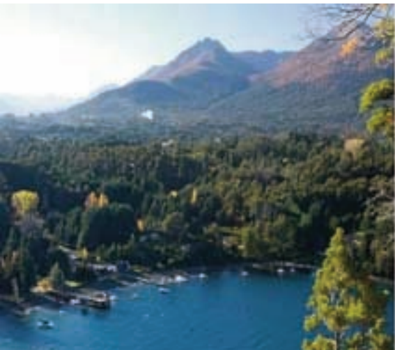
Nome: ... Indirizzo: ... Telefono: ... Sito web: ...