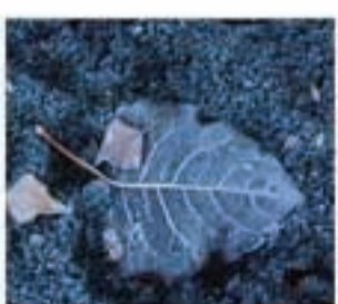
Nombre: ... Descripción: ... Ubicación: ... Fecha: ...