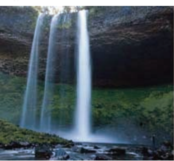
Photo: [unreadable] Photo: [unreadable] Caption: [unreadable] Caption: [unreadable]