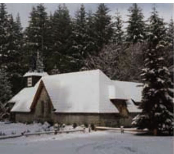
Nome: ... Indirizzo: ... Telefono: ... Sito web: ...