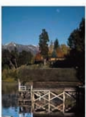
Nombre: ... Descripción: ... Ubicación: ... Fecha: ...