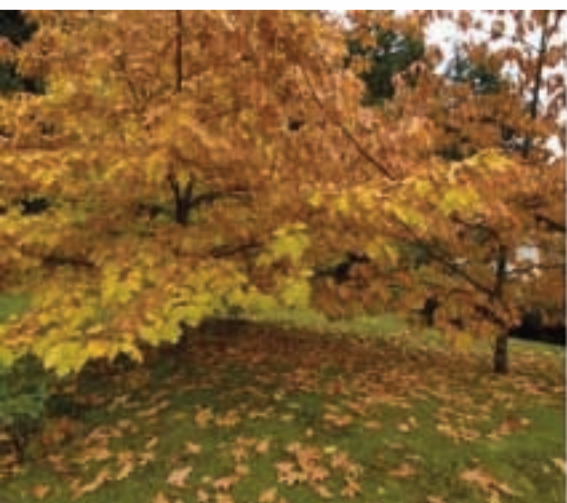
Nombre: ... Descripción: ... Ubicación: ... Fecha: ...