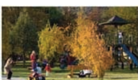
Nombre: ... Descripción: ... Ubicación: ... Fecha: ...