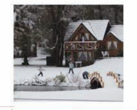
Nome: ... Indirizzo: ... Telefono: ... Sito web: ...